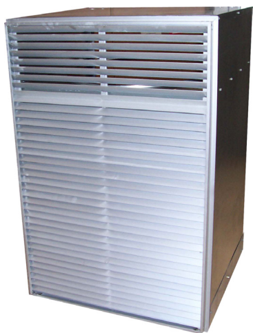
(Unit shown with architectural grille)