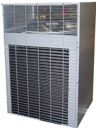
(Unit shown without architectural grille)